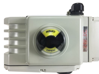
Visual Valve Position Indicator