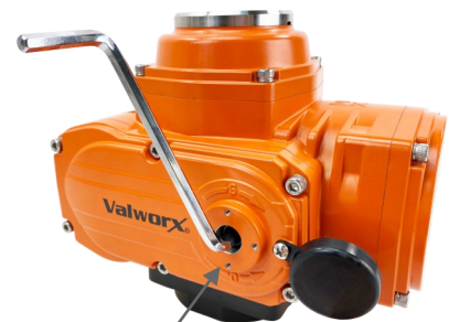
Manual override with hex wrench shown