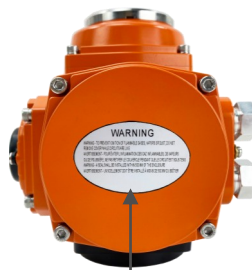
Terminal box cover