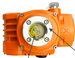
Yellow visual position indicator and cam cover